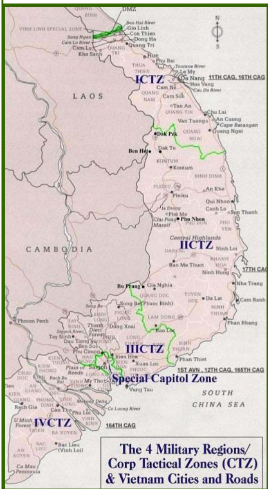
The 4 Military Regions/ Corp Tactical Zones (CTZ) & Vietnam Cities and Roads

affordable for you to travel, but also to bring other family members. You can invite your friends to come along, too. Together we will visit the sites at which we fought and which are written in our collective history. The price includes everything you see except your airfare, drinks and souvenirs. The single supplement is only $895 . If you need to visit any place in Vietnam that is not on the itinerary, please contact us and we will see if we can get you there! We are always prepared to customize this itinerary. We will do all we can to satisfy your request.